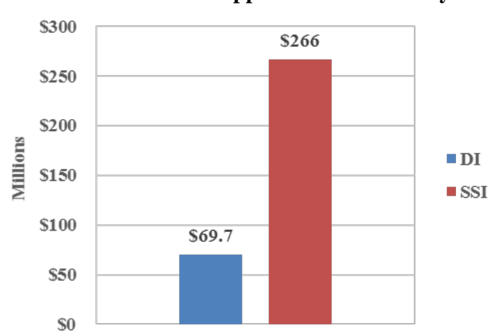
Figure 3: Projected Savings by Completing Medical Cessation Appeals Within 394 Days

In our prior reports, we calculated SSA's potential savings if it processed medical cessation appeals within 135 to 195 days. However, SSA responded that those timeframes were unrealistic. With increasing processing times and a growing backlog of hearings, we recognize it is unlikely SSA can achieve these processing times. Therefore, for our current review, we adjusted our methodology to illustrate savings if SSA completed the entire appeals process (both reconsideration and ALJ hearings) for medical cessation appeals within 394 days. We based this processing time on SSA completing reconsiderations for medical cessations within 109 days, and allowing 15 days for beneficiaries to request benefit continuation during an appeal after reconsideration. If SSA processed medical cessation appeals within 394 days, we project SSA could have avoided DI overpayments of $69.7 million and SSI overpayments of $266 million (see Figure 3 and Appendix B, Table B–4 and Table B–8).