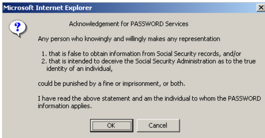
Image 1 Social Security Password Services Popup Window, Acknowledgement for Password Services.

other person is not acceptable.” The electronic equivalent of signing the report by someone other than the medical provider is for someone to obtain and use the medical provider’s username and password to submit eCE. To promote greater security and discourage medical provider’s from sharing their username and password, we encourage the Agency to add a popup window similar to Image 1 below as the medical provider begins to login to the eData website. Image 1 shows the popup screen accessed before a user can obtain a password to access information about their benefits on SSA’s online Social Security Password Services. The addition of this window may assist Federal, State, and local prosecutors, as well as SSA attorneys with any fraud prosecutions or other Social Security litigation involving this new process.